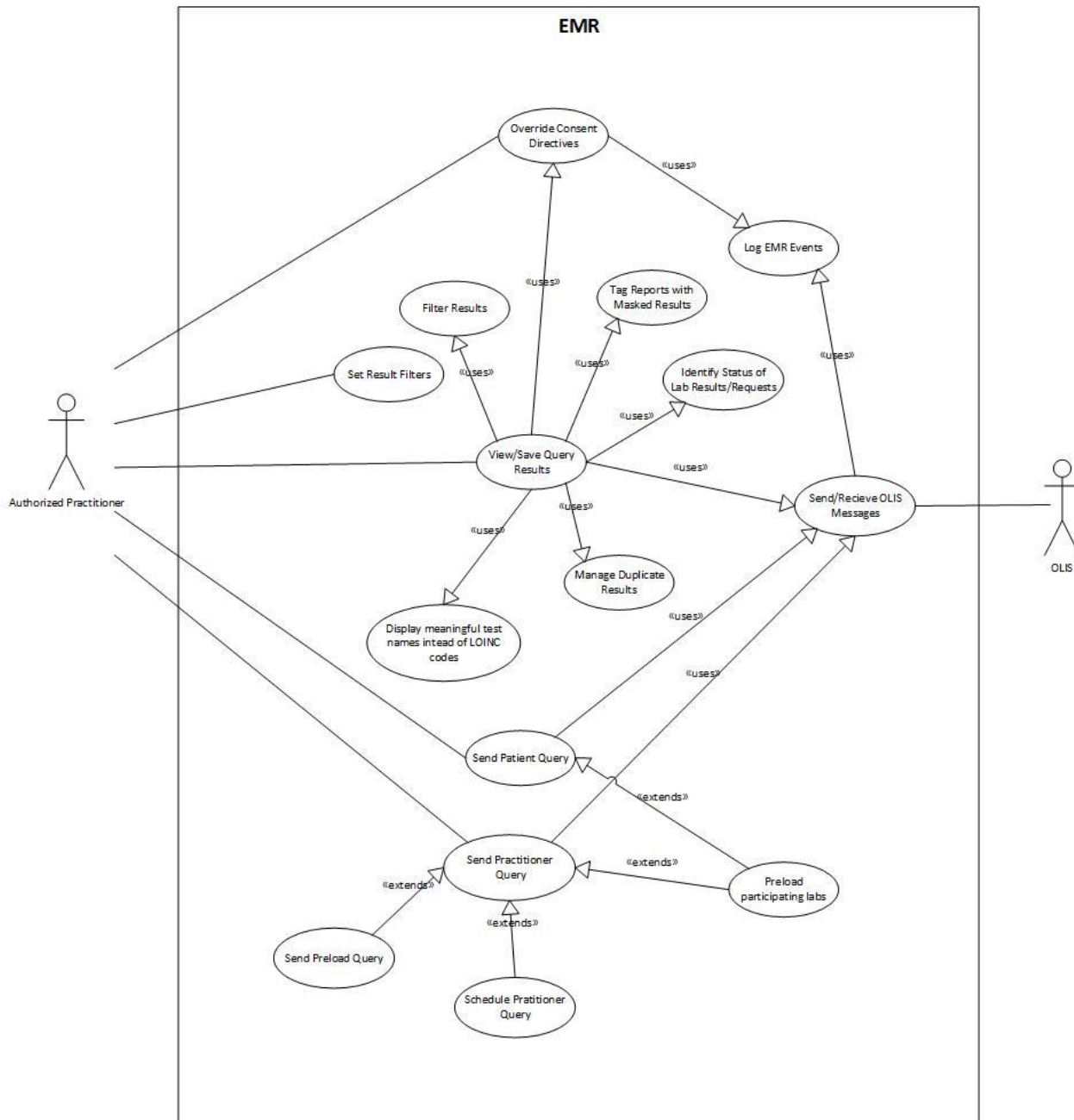
Figure 1 - EMR-OLIS Business Use Case